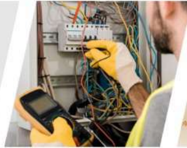
Wiring & Bos